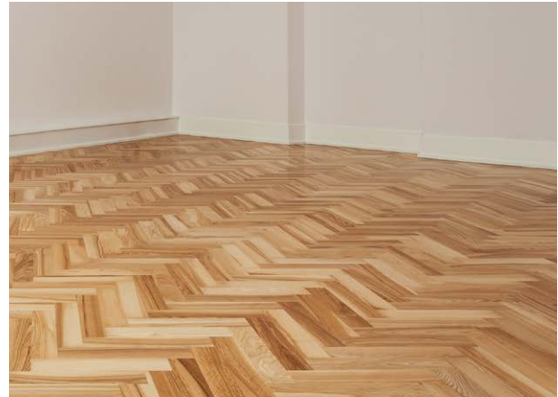
Typical application under parquetry timber floors - dual bond